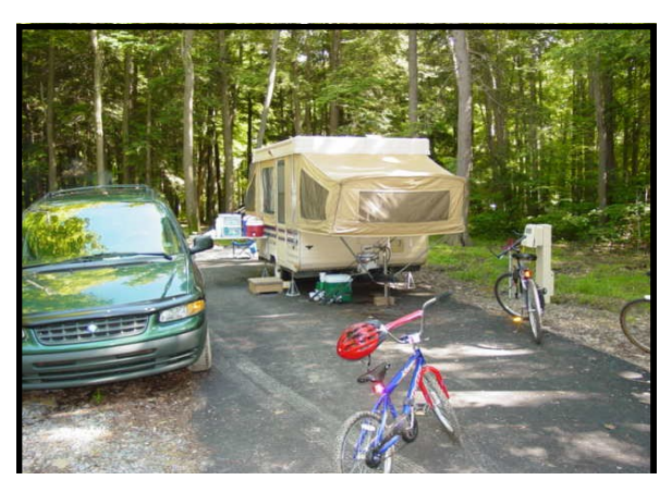
Fishing, train & hay rides, horseshoe courts, camp store, nature trail, ball field, volleyball and basketball courts, handicapped accessible fishing pier and more!