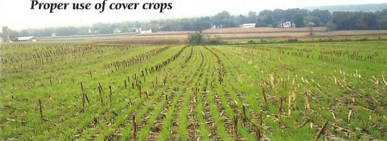
Proper use of cover crops