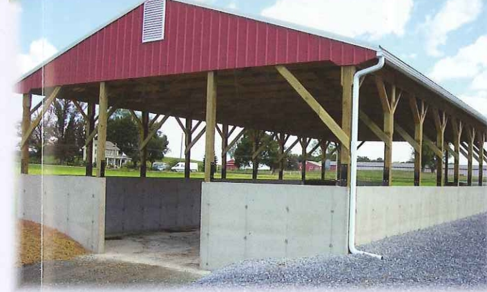
Any agricultural construction activity affecting 1 acre or more requires a Stormwater Management Plan and an NPDES permit, the same as required for all other types of construction.