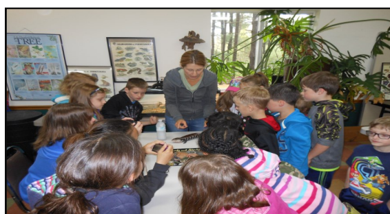
Examination of the Blue Tongued Skink