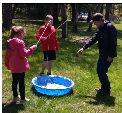
Interactive Fishing Game

On May 19th and 20th, 2016, Forest Hill's second graders attended an education day at Disaster's Edge Environmental Center. During this program, students participated in four activities. Students were able to interact with reptiles and amphibians while learning their habitats and features. A "Farm to Table" activity was set up to teach the students which foods are produced on a farm and the form they take on our kitchen tables. The students also learned about many of our regions birds and were then sent bird watching in the forest. All four groups were able to spot a variety of birds. Finally, students also participated in a fishing game, where they learned many facts about the fish.