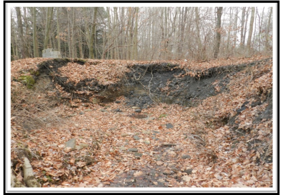
Emeigh Run Erosion issues

This project received $4,505 from the Growing Greener Grant and will be completed this summer .