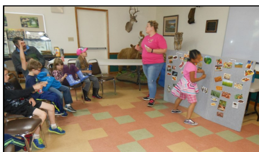
Interactive Farm to Table program

On May 13th, 2016, second graders from Johnstown Christian School participated in an education day at Disaster's Edge Environmental Center. The kids were able to learn about several of our reptiles we have on site while interacting with them. Among the reptiles were a Red Eared Slider Turtle, a Blue Tongued Skink, and a Box Turtle. The kids were also able to learn about many native species to our state, which included birds. After reviewing the common birds in our area, they were given binoculars and went on a bird hunt to find Cardinals, Chickadees, Towhees and more. Next the students participated in a program called "Farm to Table." This program taught them the many types of food that come from farms and the different forms they take on our table. The day concluded with a nature bingo walk, where the students searched for nature items to mark off a bingo card.